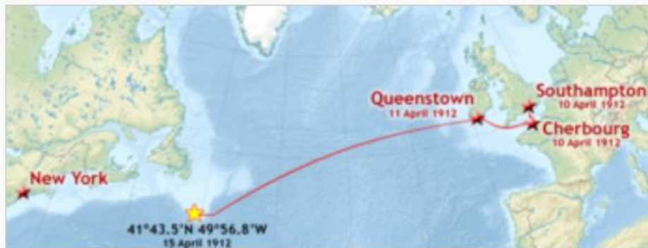
Route of Titanic's maiden voyage from Southampton to New York